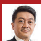
Kodrat Wibowo SE, Ph.D, Commissioner Indonesia Competition Commission (KPPU)